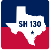
STATE HIGHWAY 130

SH 130 segments 5 & 6 form a 41-mile link through Travis, Caldwell and Guadalupe Counties to I-10 in Seguin. Drivers can bypass I-35 traffic from north of Austin to San Antonio, enjoying speed limits up to 85 miles per hour.